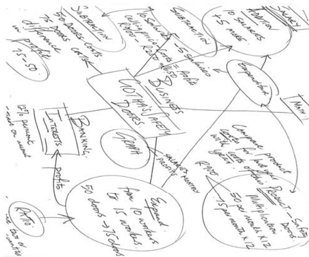
Figure 3: The mathematics teacher’s concept map